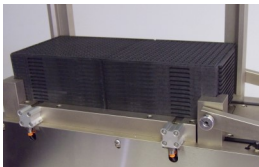
JEDEC Tray Stack