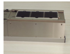
Waffle Packs in Carrier